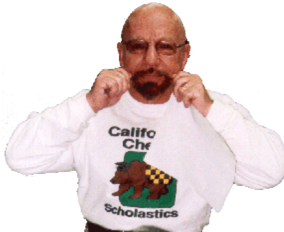
Hamming it up for his cronies