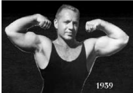
Fair Warning...Do not arm wrestle this guy.