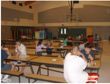
High School Section Players

Posted by Anonymous on Monday, August 15 @ 11:05:27 CDT